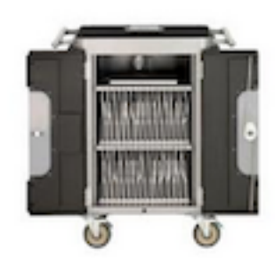
Cart Codes Have Changed

Last year Driscoll did a fun AND educational assignment with her class using the iPads. They recorded how many teeth each student had lost and then used Doodlebuddy to create a graph of the results. Student names were on the X axis and # teeth lost on the Y axis. Due to space restrictions they graphed the data for the people in their table group, not the whole class. Great idea, Amy!!